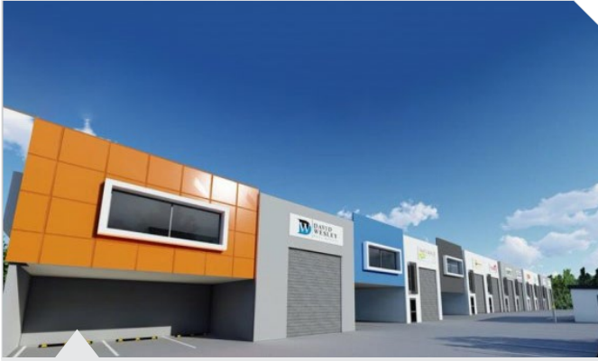
Construction of Industrial Warehouses. Various Locations