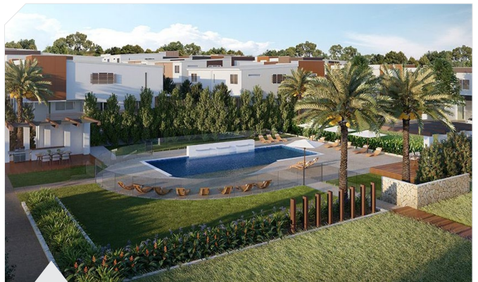
Construction of multi-stage development 106 town houses. South East QLD