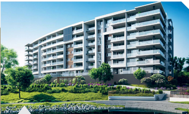
Staged construction of 374 Units. Varsity Lakes, Gold Coast