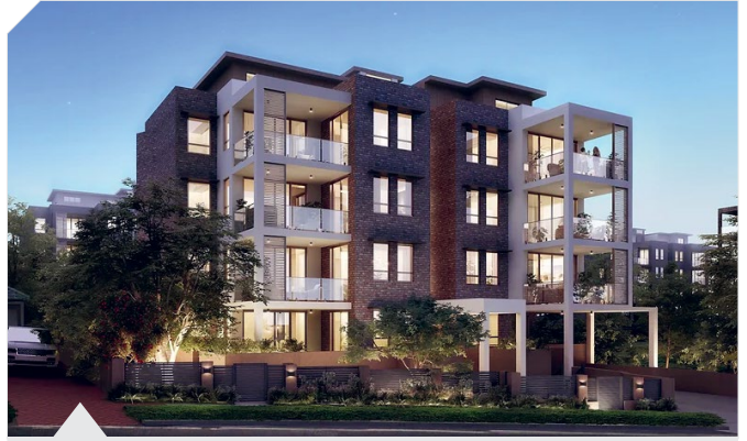
Construction of 22 Apartments. Sydney