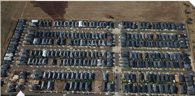
Funded multi-stage land subdivision comprising 303 lots. Victoria

Enquire today to start the fast, bank-free process of funding for your project: